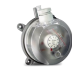
Air Pressure Switch