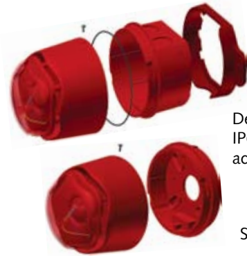
Deep base with IP66 mounting accessory