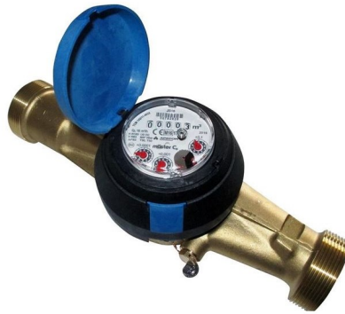
25mm / 32mm / 40mm