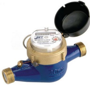
15mm / 20mm