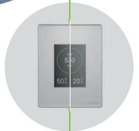
Occupiable rooms for aerobic exercise such as sports halls and gymnasiums.