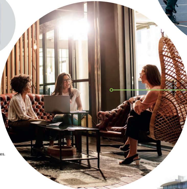
Occupiable rooms in offices.