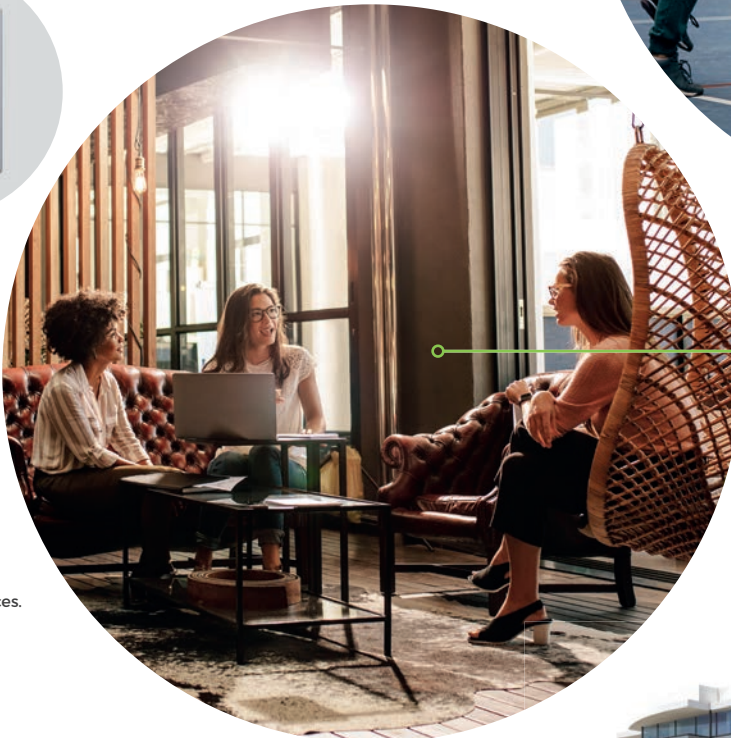
Occupiable rooms in offices.